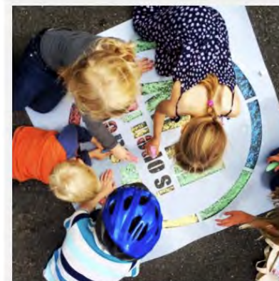
Play Streets can be a load of fun... until the council starts demanding money